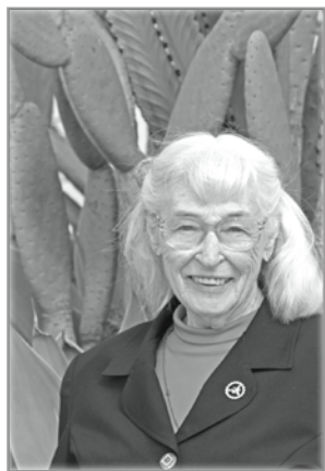
We are surrounded by

rocks of many kinds, but did you ever wonder how so many came to be here? Being curious, I thought I'd ask and was amazed at the answers and explanations received.